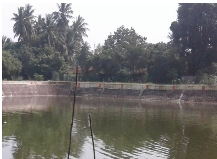
Fig. 1: Sri Aayiram Kaliyamman Temple tank, Karaikal.