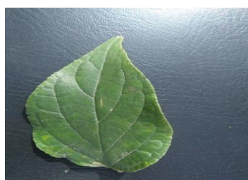
Fig.2leaves showing morphology.