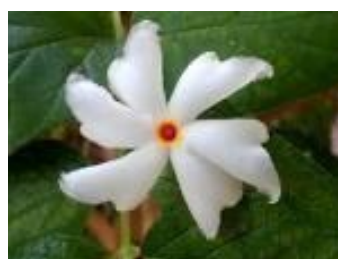
Fig.3 Flowers of Nyctanthes arbor-tristis .