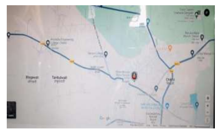
Fig: Map showing the locations of collected water sample In and Around chikhli city.

Nine water samples were collected from various water bodies in and around Chikhli city, of which Five were surface water, while four were underground water comprising of four shallow and Two deep aquifers, wells, bore, tube wells along with one water sample collected from BHIMA Dam built on the banks of Bhima River (biggest reservoir of Buldhana Municipal Corporation). For spectroscopic analysis of these water samples, a flame photometer was employed (Anuradha college of pharmacy). The flame photometer was calibrated using the standard stock solution of sodium and potassium having 30 ppm concentration. Various other instrumental parameters were adjusted to fine-tune the flame. After instrumental calibration, it was run to examine the collected water samples. For examination, 100 ml of water from each collected sample was taken in standard laboratory plastic bottles and then the water samples were poured inside the flame photometer. All the samples were collected during the dry summer season in the month of April when the average temperature was 33