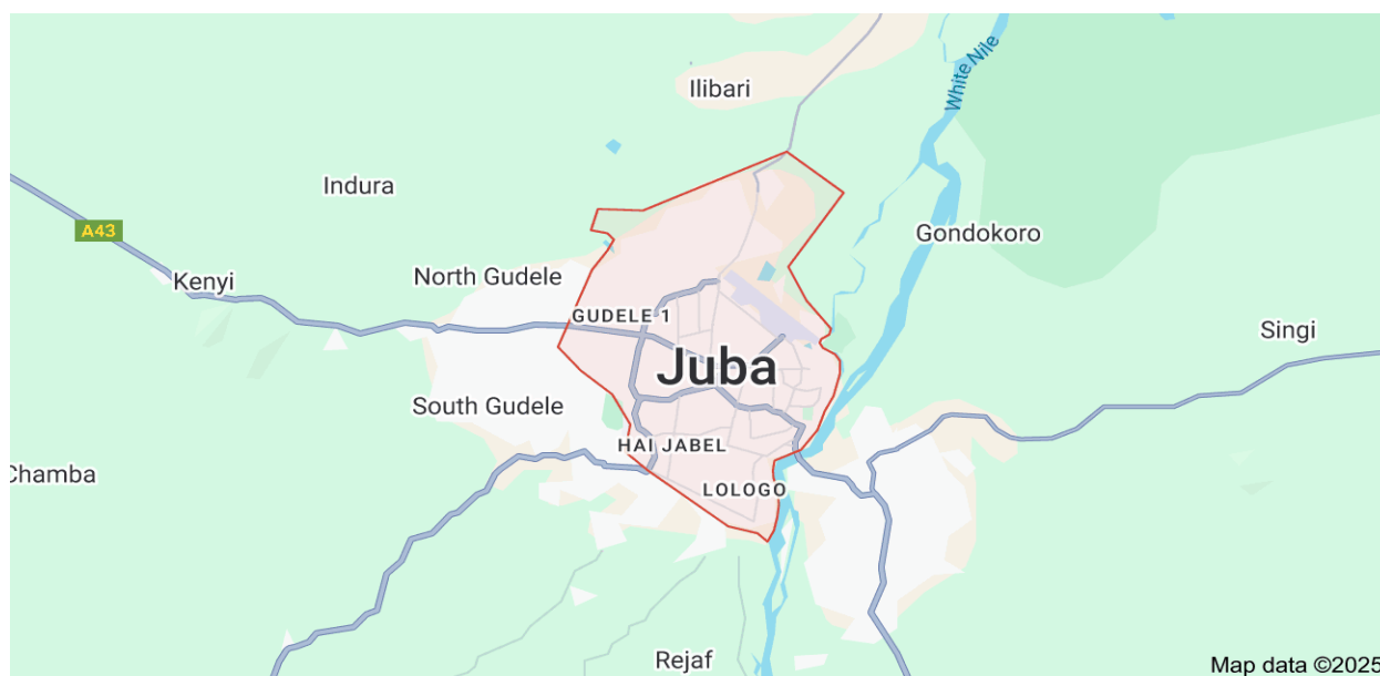
Figure 1: Map showing study areas.

Juba is the capital city of South Sudan, as well as the most populous city in the country, founded in 1922. Located near the White Nile. It is a key tourist, cultural and economic center of the country, with many businesses, industrial and commercial facilities, representative offices, and companies. Juba is a center of financial activities and investments, and it is considered one of the most rapidly developing cities on the continent, with a blossoming economy and great perspectives for business.