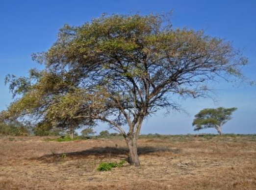
Figure 2: Habitat of Zizyphus mauritiana.

All the organoleptic characteristics revealed during this study are recorded as odourless, peppery taste, Light green colour, woolly texture.