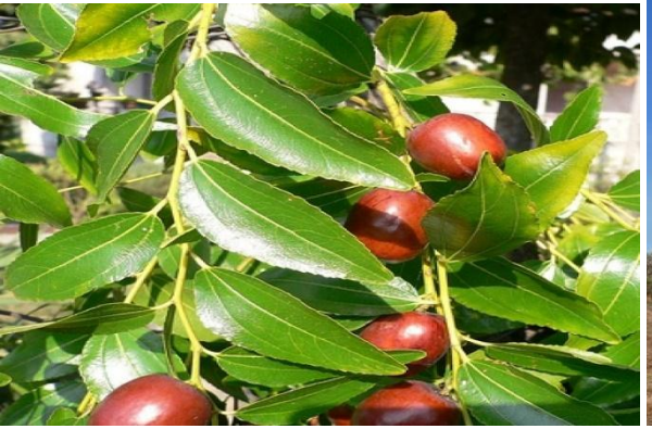
Figure 1: Leaf and Fruits of Zizyphus mauritiana.

This study allowed us to make an identification of the plant material, and is the first step in the characterization of the crude drug. Zizyphus mauritiana.