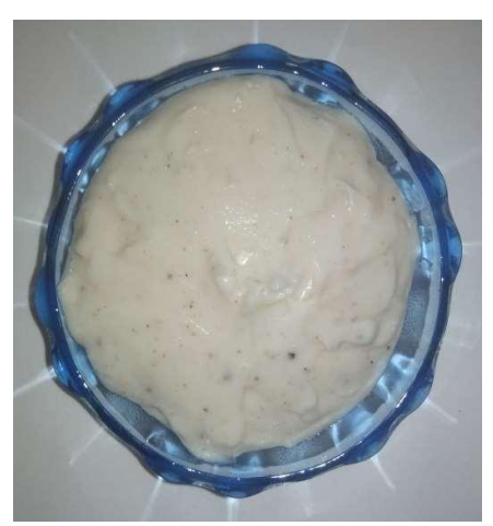
Figure 2: Rasala (shikhirini).