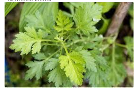
Fig. 1.8: Artemisia annua.

Artemisis is a genus of a about 400 species that is found