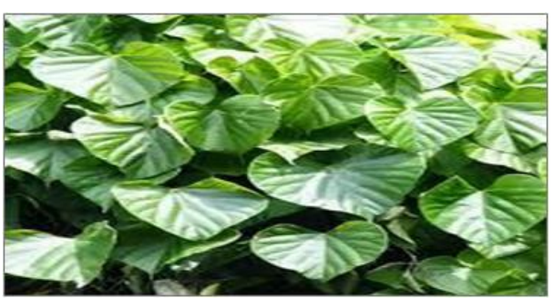
Fig. 1.5: Tinospoara cardifolia (wild) miers.

Tinospora cordifolia stem is used for common debility, dyspepsia, fever, urinary disease and jaundice. It is important in anti-inflammatory, anti-arthritic, anti-allergic properties. [18]