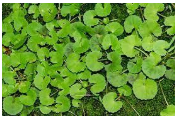
Fig. 1.6: Centella asiatica linn.

These extract a number of bioactive components is useful in anti-cancer activity. Centella asiatica used for treatment of psoriasis and originate to be effective in destroying cultured cancer cells. [18]