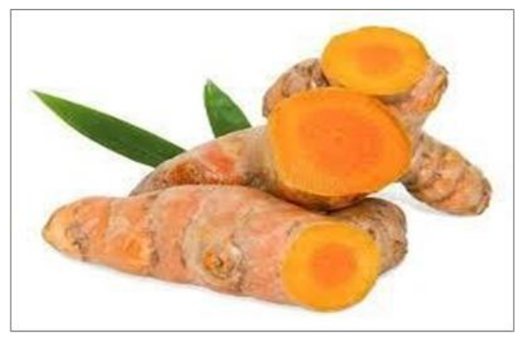
Fig. 1.3: Curcumin longa.

It is belongs to family Zingiberaceae. The Indian herb of Curcumin is a polyphonol compound.