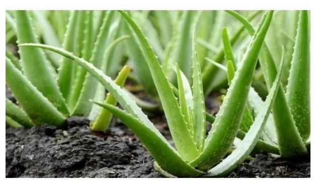
Fig. 1.7: Aloe vera.

Aloe Vera used anticancer activity through stimulating the scavenging white blood cells.