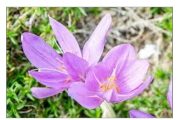
Fig. 1.2: Autumn crocus.

Common names- Naked ladies, Colchicum, and Meadow saffron. Family- Liliaceae.