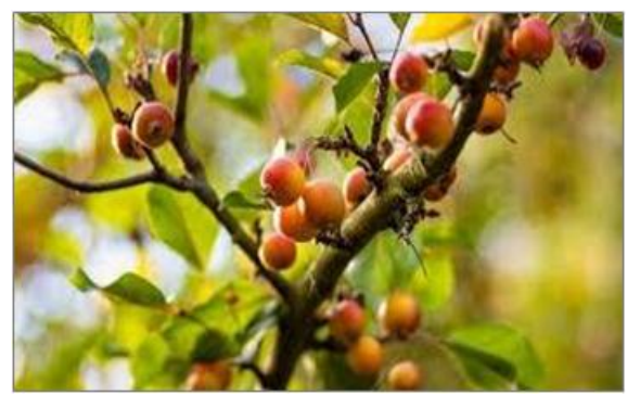
Fig. 1.4: Garcinia indica.

The garcinolat IC50 standards for 72h treatments shows the physically powerful inhibitory properties in all intestinal cells. It is also useful anticancer properties. [17]