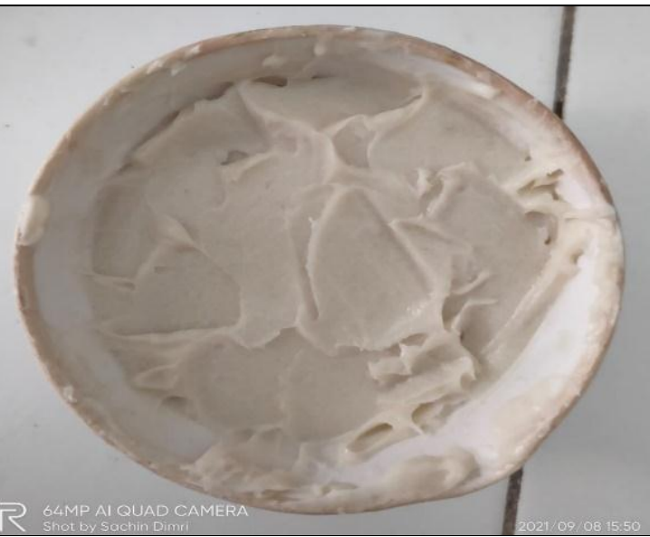
Fig. 5: (Lagerstrowmia speciose Leaves Cream Formulation).

UV Spectrophotometric method which was found to be 0.70 & amp; the following observations were observed (Table No: 3)