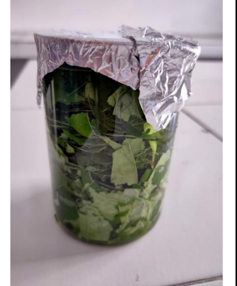
Fig. 3: (Ethanol Solvent Extraction).