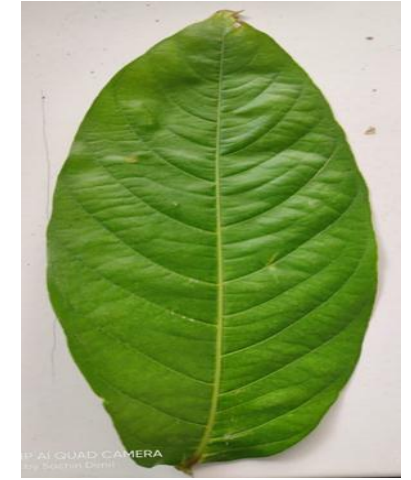
Fig. 2: Lagerstrowmia speciose Leaves.

Lagerstroemia speciosa is a species Lagerstroemia in the family Lythraceae. This plant is also known as the pride of India or as a species of Qween pancake plant. The common name is Jarul. It is a small or medium sized plant (20-30 m), the size of leaves is 8-14 cm long or 37 cm wide, flower size 20 to 30 cm and petal size 23 cm. Basically, this plant grows in India, the southeast. It is an ornamental plant<sup>[8]</sup> The seeds of this plant have addictive properties. Different parts of the plant may have different activities because the leaves have a hypoglycaemic effect and the fruit is used to treat mouth ulcers. Corolla acid, amyl alcohol, ellagic acid, hydroxybenzoic acid, methionine and alanine, these chemical components are present in the plant. The pharmacological properties or uses of this plant include antidiabetic activity, antiviral activity, cytotoxic activity, anti-inflammatory activity, antioxidant activity, antibacterial activity.<sup>[9]</sup>