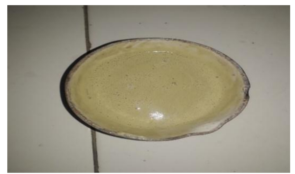
Fig. 6: (Lagerstrowmia speciose Leaves Lotion Formulation).

UV Spectrophotometric method which was found to be 2.49 & amp; the following observations were observed (Table No: 3)