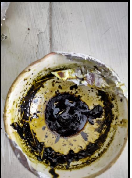
Fig. 4: (Ethanol Extract).