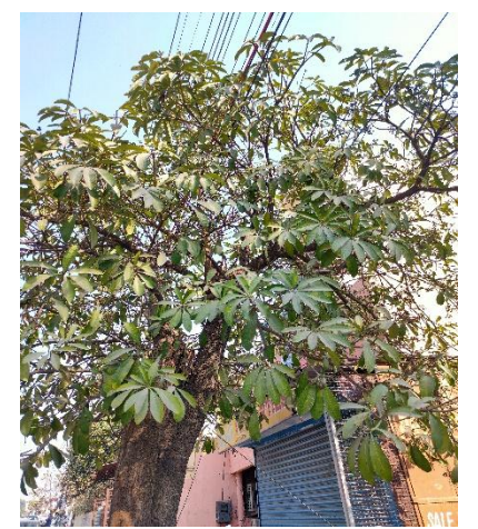
Fig. 1: Lagerstrowmia speciose Tree.

Abs (\lambda) – Spectrophotometric absorbance values at wavelength \lambda .