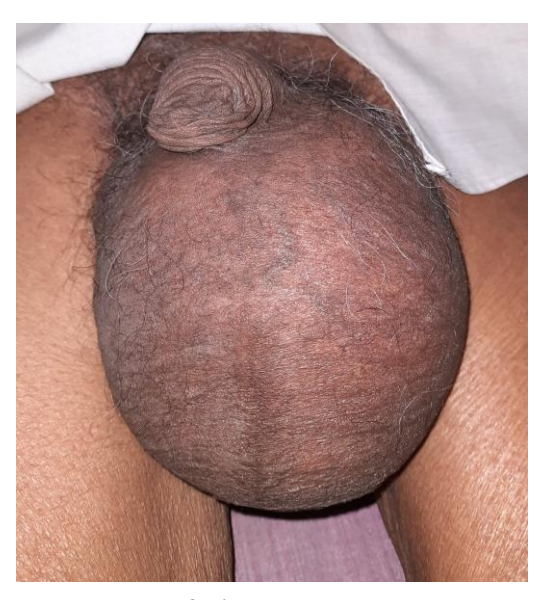
Left sided hydrocele